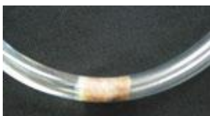
Prior to treatment, a "sugar snake" is blocking the line

Roto-Rooter Sugar Residue Digestant acts fast – usually within 24 hours.