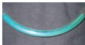
After 24 hours, Roto-Rooter® Sugar Residue Digestant has completely eliminated the sugar buildup.

The special misting unit ensures that Roto-Rooter® Sugar Residue Digestant completely coats the walls of the drain line to help solve the problem quickly.